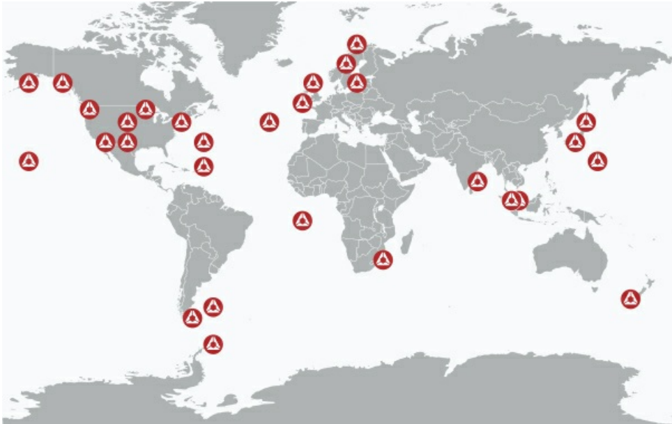
The graphic above depicts the locations of Spire's ground stations throughout the world as of April 25, 2021.

We operate a large constellation of LEMUR satellites along with a global network of ground stations. By operating our own satellites and ground stations, we are able to quickly and efficiently collect large volumes of data and make them available to our customers.